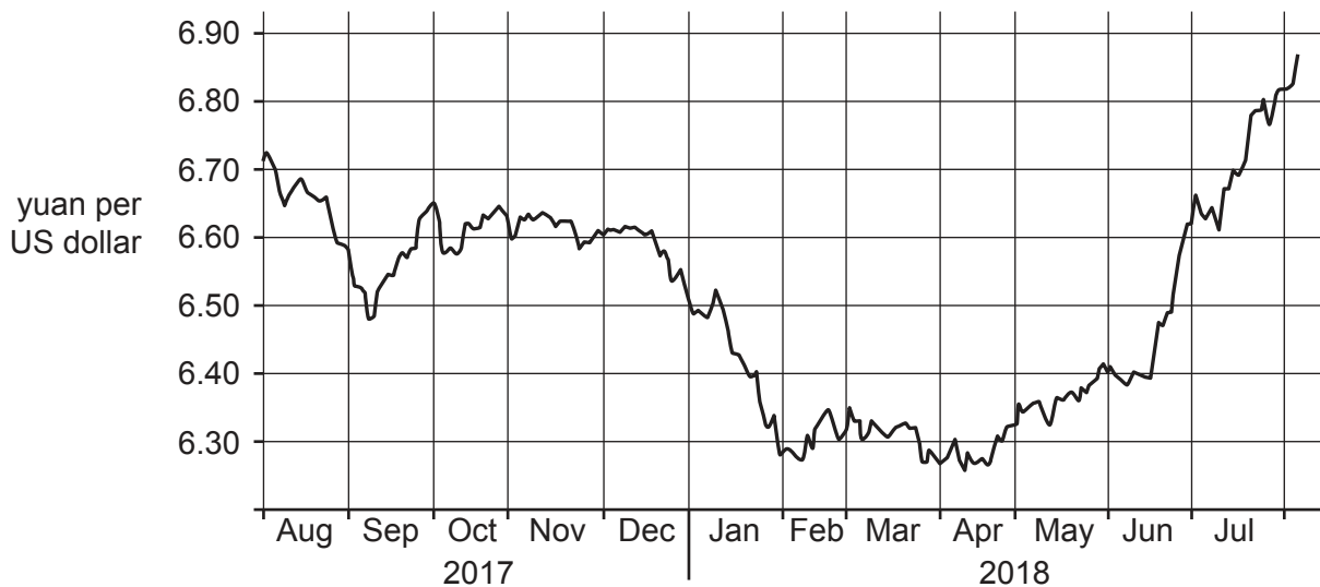
Fig. 1.2: Chinese yuan to US dollar rate of exchange, August 2017 to July 2018